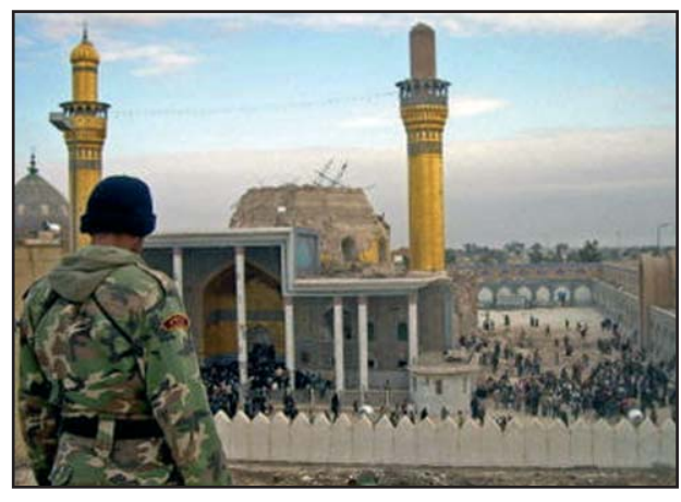
The Al-Askari Shrine, Samara, after the bombing of 22 February 2006