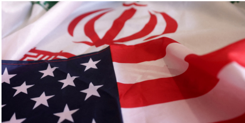
USA and Iranian flags are seen in this illustration taken Sept. 8, 2022.

Lawmakers in the US Congress on Tuesday demanded answers over a pair of bombshell reports alleging that a Biden administration official was part of an Iranian influence operation to shape public opinion about the regime in Tehran and its nuclear program.